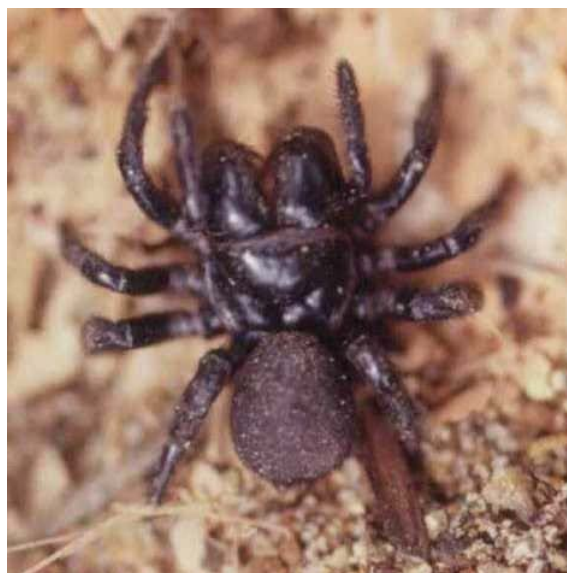
Figure 4. The northern mouse spider, Missulena pruinosa (female)