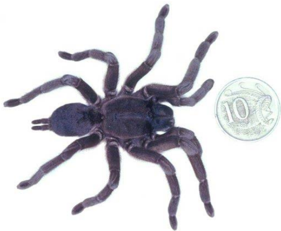
Figure 5. The barking spider, Selenocosmia sp.

Barking spiders are usually encountered in Palmerston and the rural area, and less frequently in Darwin suburbs. Specimens stored at Berrimah Farm indicate that these spiders were common in the residential areas of Darwin between 1964 and 1974. Some species of barking spiders include the largest spiders (in body size) known in Australia. They are brown to dark brown in colour with short hairs on the body giving them a furry appearance. Barking spiders live in burrows and emerge at night to catch prey such as insects, lizards, geckos, spiders or small birds. These spiders are generally not aggressive unless provoked. The venom is not considered dangerous although the bite can be painful (Figure 5).