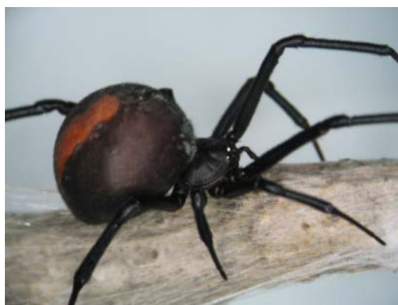
Figure 1. The redback spider, Latrodectus hasseltii (female)

The female spiders rarely bite unless they are touched or handled. Although no fatalities due to bites have been recorded since the introduction of anti-venom in 1956, bites are painful and must be treated as potentially dangerous. The male spider is much smaller and is not considered dangerous. Redbacks have a spherical abdomen, black legs and a black cephalothorax (where the legs are attached). The female usually has a red stripe on the top side (dorsal side) of the abdomen and an hourglass shaped red mark on the underside (ventral side) of the abdomen. The white or cream coloured egg sac is round with a smooth surface and is about 6 mm in diameter (Figure 1).