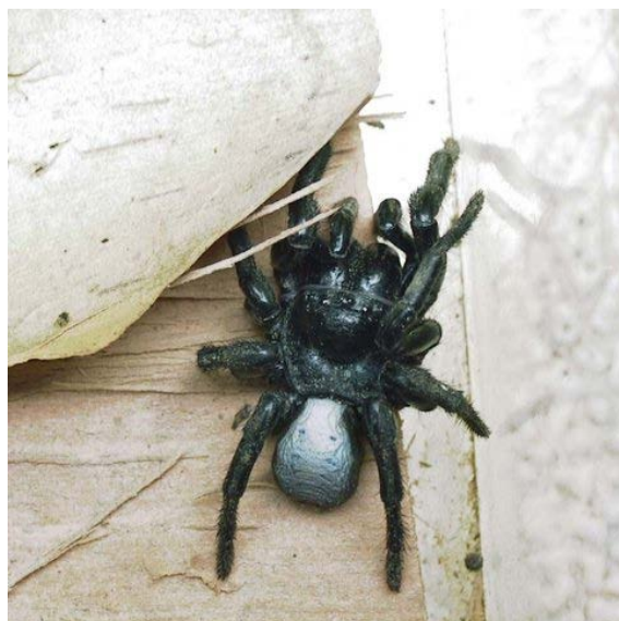
Figure 3. The northern mouse spider, Missulena pruinosa (male)

The northern mouse spider is dark brown to black in colour with shiny black legs and cephalothorax. Females are about 30 mm in body length and are larger than the males, which are about 18 mm in body length. The males have a distinctive white or bluish-white patch on the top of the abdomen. Males are often seen wandering in search of females from August to December. Females rarely leave the burrow and are usually not encountered unless their burrows have been flooded after heavy rainfall or they have been disturbed by gardening or earth works. No fatalities have been recorded from bites of this species although the bite can be painful and cause headache and nausea (Figures 3 and 4).