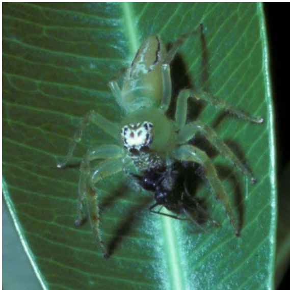
Figure 10. The northern green jumping spider, Mopsus mormon (female)

The northern green jumping spider Mopsus mormon is the largest salticid in Australia (measuring up to 18 mm in length for the female and 12 mm for the male). The male is green with long strong front legs with black or brown coloured femora (first long segment of the leg), the other legs are light brown with green femora. The female is green and does not have black markings on the two front legs. The area around the eye spots is patterned with red and white (Figure 10).