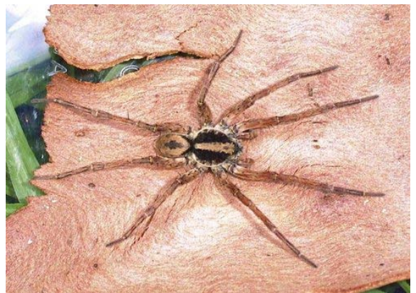
Figure 9. The wolf spider, Lycosa sp.

Wolf spiders are not considered dangerous but if handled or provoked they may give a painful bite (Figure 9).