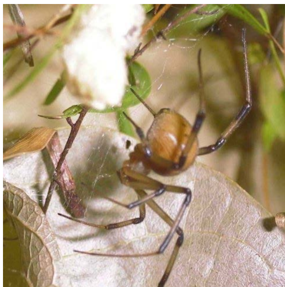
Figure 2. The brown widow spider, Latrodectus geometricus (female)

The introduced brown widow spiders are related to the redback and are not considered dangerous. They are usually brown, grey or sometimes dark brown in colour with markings on the abdomen. Some specimens of brown widows and redbacks may look similar to untrained eyes. Examining the egg sacs can help distinguish between the two species. Although egg sacs of both species are white or cream in colour, those of the redback have a smooth surface and those of the brown widow have a rough surface (Figure 2).