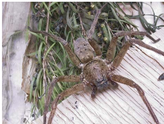
Figure 6. The huntsman spider, Heteropoda sp.

The most common huntsman spider species in the Darwin area is Heteropoda sp. which is mottled brown in colour. Other species occur and range from yellowish-brown, pinkish-brown to greyish-brown with markings on the underside of the abdomen and bright bands on the underside of the joints of the legs (Figure 6).